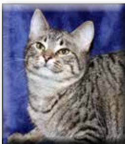
Princess Leia Unspayed Female Short Hair (DSH) Grey Tabby Approximate date of birth: August 26, 2015 Origin: Stray