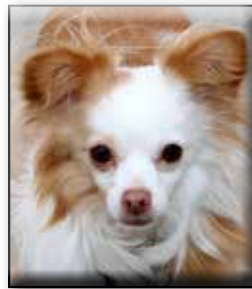
Daisy Neutered Male Poodle/Bichon Approximate date of birth: August 2007 Origin: Rescue