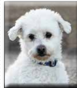
Charlie Neutered Male Poodle/Bichon Approximate date of birth: August 2007 Origin: Rescue