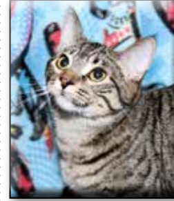
Padme Unspayed Female Short Hair (DSH) Brown Tabby Approximate date of birth: August 26, 2015 Origin: Stray