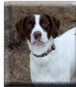
Gunner Neutered Male Pointer Cross Approximate date of birth: July 2013 Origin: Stray