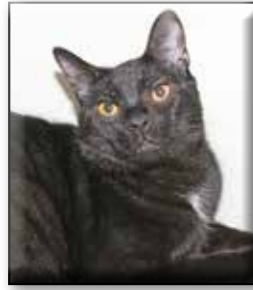
Bandolero Neutered Male Medium Hair (DMH) Black Approximate date of birth: April 2015 Origin: Stray