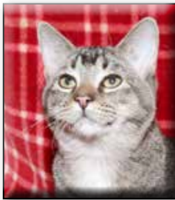
Ducati Neutered Male Short Hair (DSH) Brown Ticked Tabby Approximate date of birth: July 2015 Origin: Abandoned