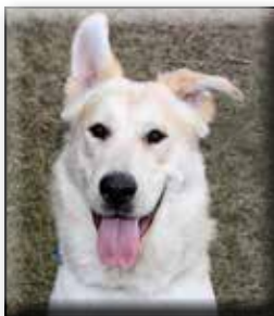
Hendrix Unneutered Male German Shepherd Cross Approximate date of birth: September 2014 Origin: Stray