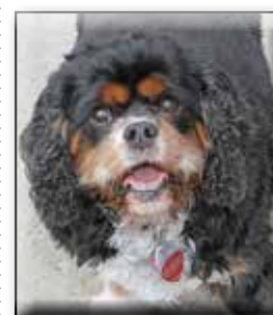
Shay Spayed Female Approximate date of birth: September 2009 Origin: Owner passed away