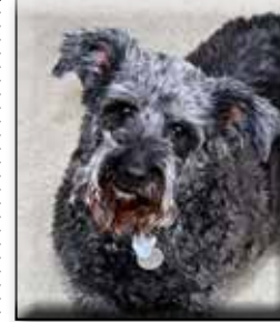
Betsy Spayed Female Scottie Cross Approximate date of birth: December 2006 Origin: Owner passed away