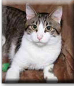
Magnum Neutered Male Short Hair (DSH) Tabby & White Approximate date of birth: January 2015 Origin: Stray