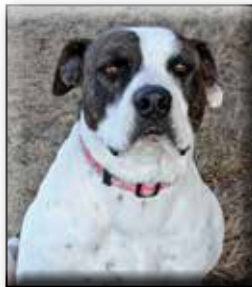
Brindy Spayed Female Pit Bull Approximate date of birth: February 2013 Origin: Rescue