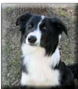
RickyBobby Unneutered Male Border Collie Cross Approximate date of birth: March 2015 Origin: Stray