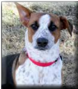
Brook Unspayed Female Hound Cross Approximate date of birth: August 2014 Origin: Stray