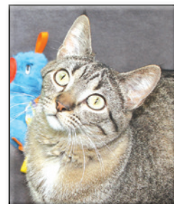
SUNSHINE Spayed Female Short Hair (DSH) Brown Tabby Approximate DOB: March 2022