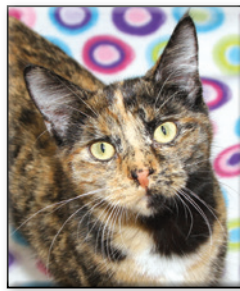
MESQUITE Spayed Female Short Hair (DSH) Tortie Approximate DOB: August 2022