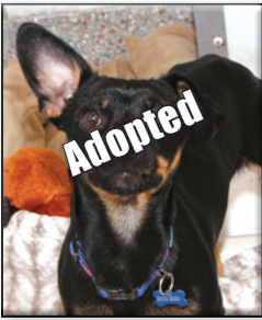
GARRETT Unneutered Male Miniature Pinscher Mix Approximate DOB: March 2022

See more CDHS adoptable pets at www.cdhs.net