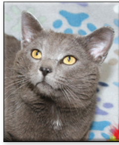
MAGNUS Unneutered Male Short Hair (DSH) Gray Approximate DOB: March 2022