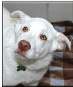
MARTIN Neutered Male Shepherd/Lab Mix Approximate DOB: October 2022