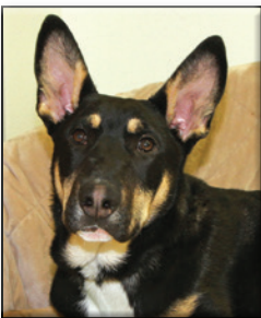
HANK Neutered Male German Shepherd Mix Approximate DOB: August 2022