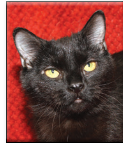
PARTRIDGE Spayed Female Short Hair (DSH) Black Approximate DOB: March 2022