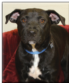
MINDY Spayed Female Lab Mix Approximate DOB: August 2022