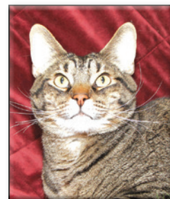
WIGGLES Neutered Male Short Hair (DSH) Brown Tabby Approximate DOB: March 2018