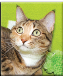
JASMIN Spayed Female Short Hair (DSH) Calico/Torbie Approximate DOB: September 2015