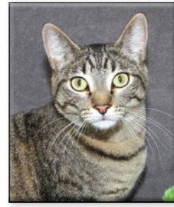
PAISLEE Spayed Female Short Hair (DSH) Brown Tabby Approximate DOB: March 2022