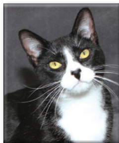
MR. FEZZIWIG Neutered Male Short Hair (DSH) Black and White Tuxedo Approximate DOB: July 2022