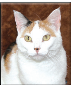
KEIRA Spayed Female Short Hair (DSH) Calico Approximate DOB: January 2020